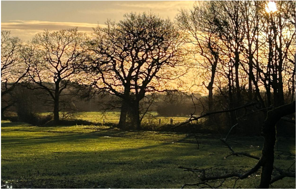
View from Tunman wood perimeter– TOTH circular