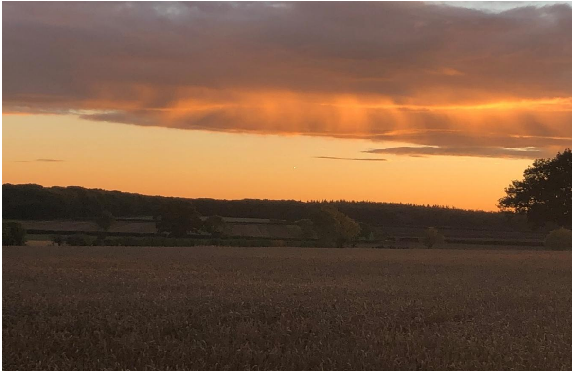
Perimeter of Tunman wood – TOTH circular