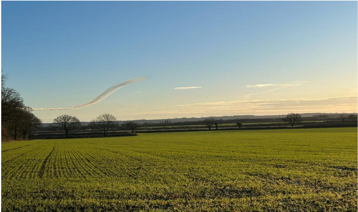
Exiting the wood enroute back to TOTH